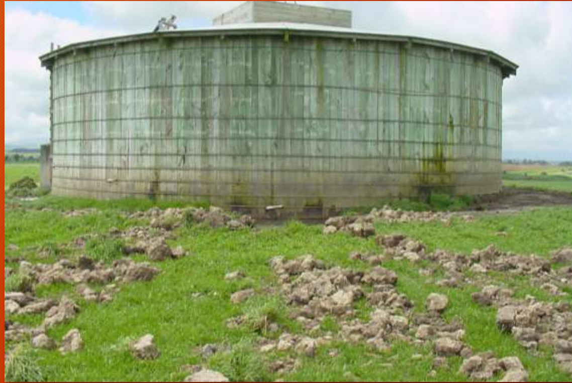
Reservoir - permission from H Winder, access via Awawa Road